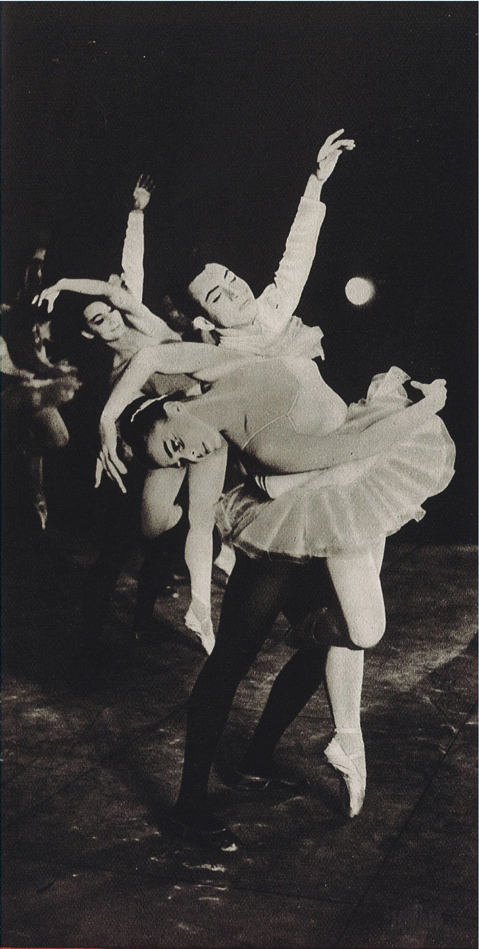
Summer Festival, Ballet.

TOURIST INFORMATION OFFICE IN SAN SEBASTIAN: Idlázquez, 8 Tel. 11774