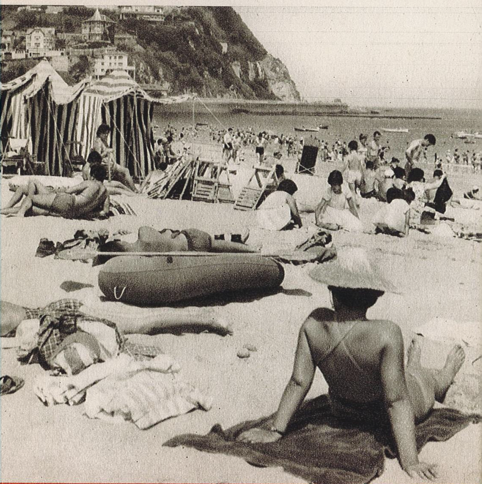
ABOVE: Lasarte Race-course. BELOW: Ondarreta Beach.